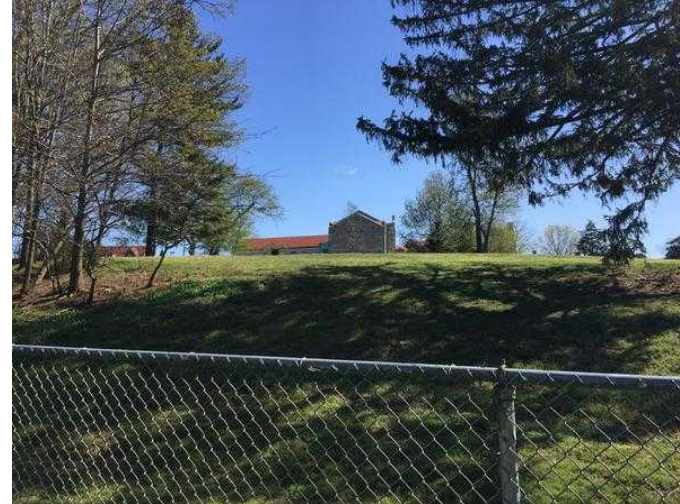
View of site from 4 th Street, NE