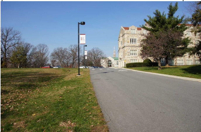
View north into site from interior private street