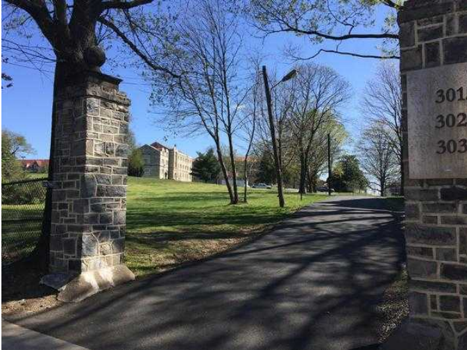
View from Entrance at 4 th Street, NE (SE of site)